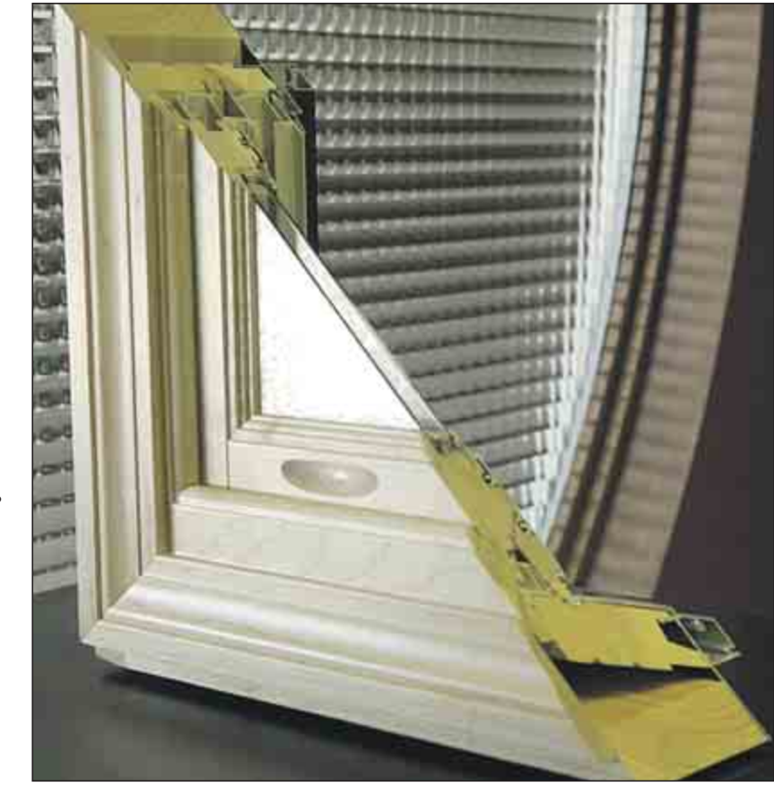
A cross section of a high-efficiency wood window is one of the product choices available at Meloche Windows.